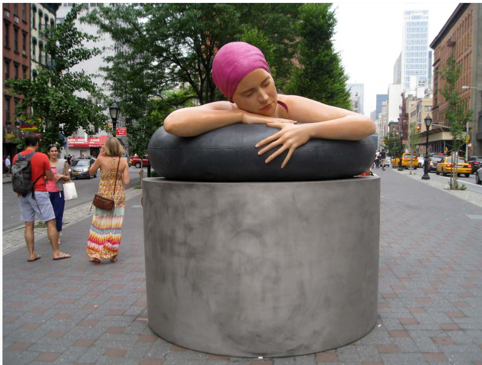
"Survival of Serena," 2012 (painted bronze).