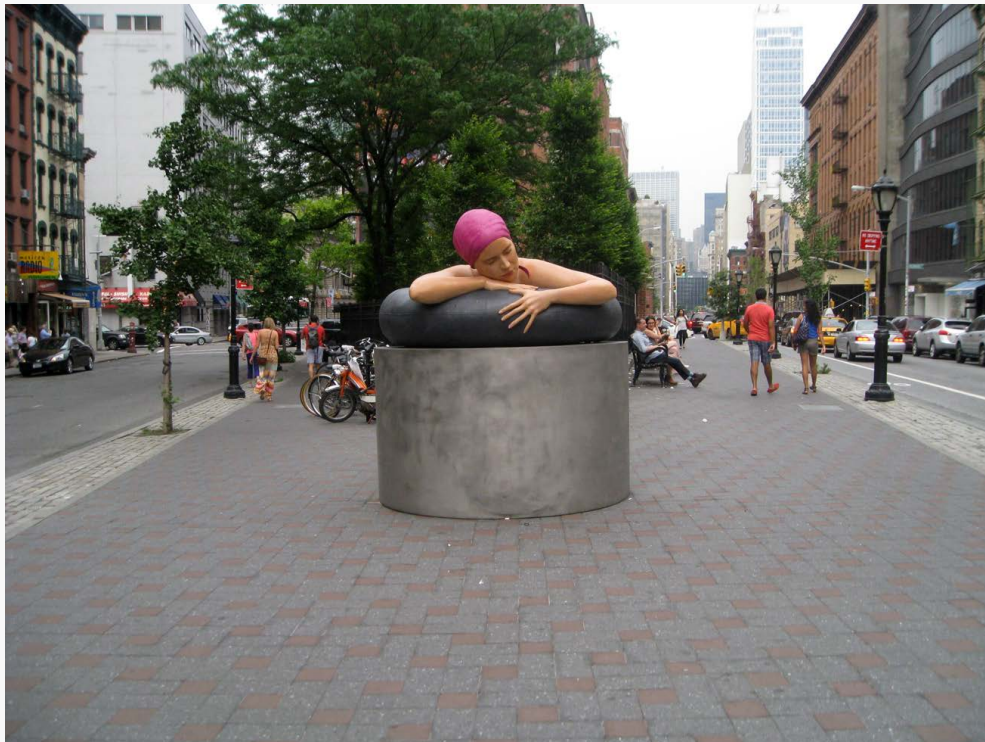
Installation view at the intersection of Lafayette Street and Cleveland Place.