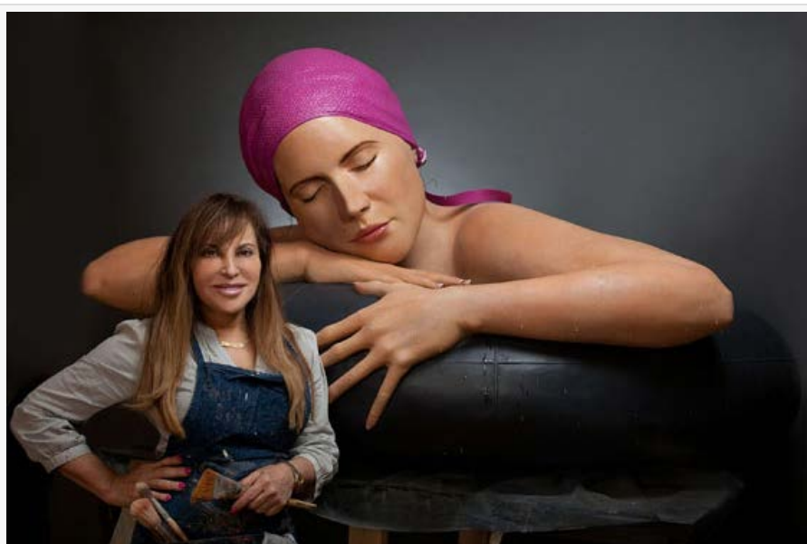
CAROLE FEUERMAN'S SURVIVAL OF SERENA MAKES A SPLASH IN PETROSINO SQUARE

on MAY 12, 2012 · LEAVE A COMMENT · in NEW YORK